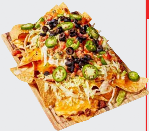
JAKE'S NACHOS SUPREME

Sweet chilli | Honey bbq | Medium buffalo | Hot buffalo | Sweet heat rub | Lemon pepper rub